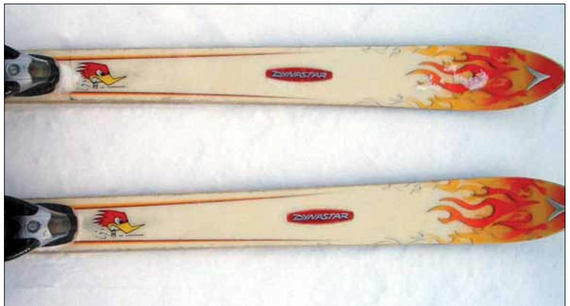
Ski mask photo by "tk-link" on Flickr; Photo of skis by "Telstar Logistics" on Flickr